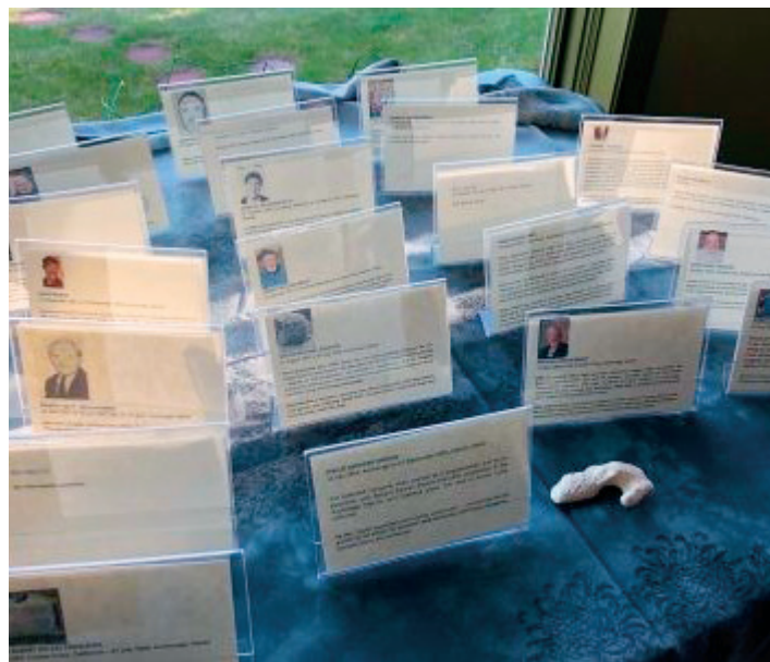
Honoring those who passed away.

"In reality, those seventh graders were responsible for teaching me the skills of teaching," she said.