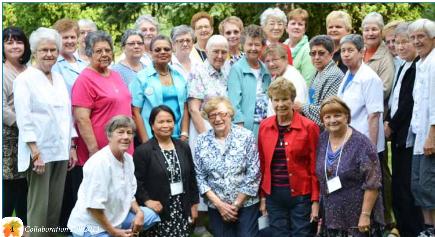
Below: Associate leaders and community liaisons at the second Associate Leadership gathering in Spokane, WA.