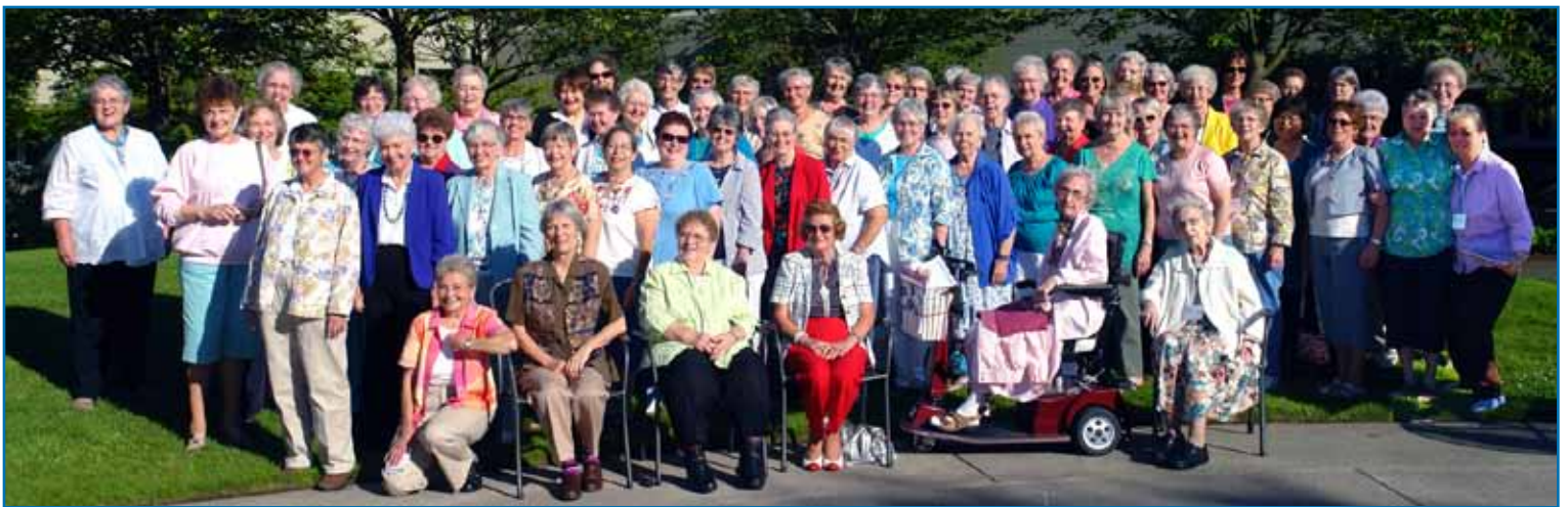
Women of Providence gather for a photo on the Providence Health & Services campus in Renton, WA.