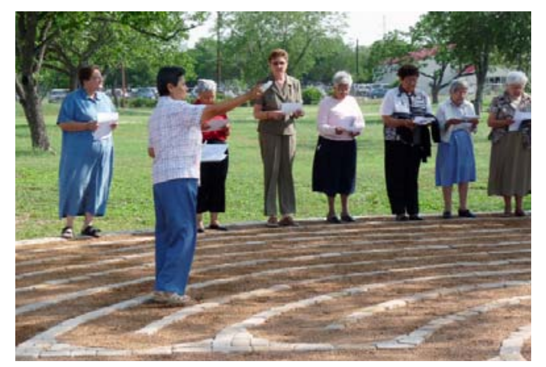
The MCDPs bless their newly constructed prayer labyrinth this past May.

MISSIONARY CATECHISTS OF DIVINE PROVIDENCE, SAN ANTONIO, TEXAS