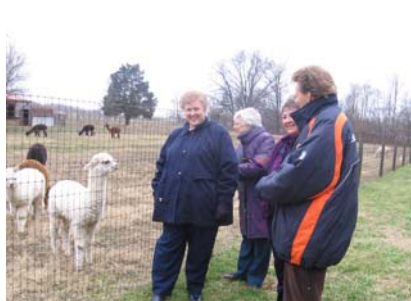
Providence Event 2008 Planning Committee meets some of the local residents—the alpacas—of the White Violet Center in Saint-Mary-of-the-Woods, Indiana.

The format of Providence Event '08 is different this year. We will have two tracks, and it will be a week-long event, June 8-15, 2008 . Track One will begin Sunday evening and include a