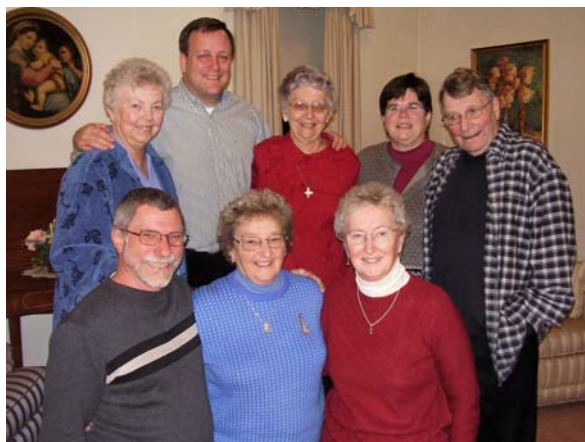
Participants at the Year End Retreat at the Genesis Spiritual Life Center.