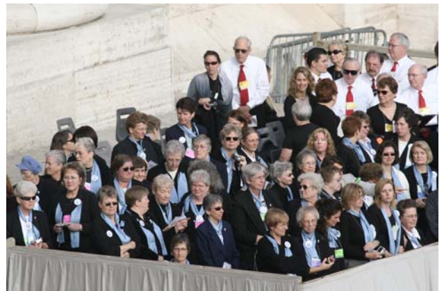
The Sisters of Providence choir at the canonization

Saint Mother Theodore's shrine continues to be open to the public daily in the Church of the Immaculate Conception.