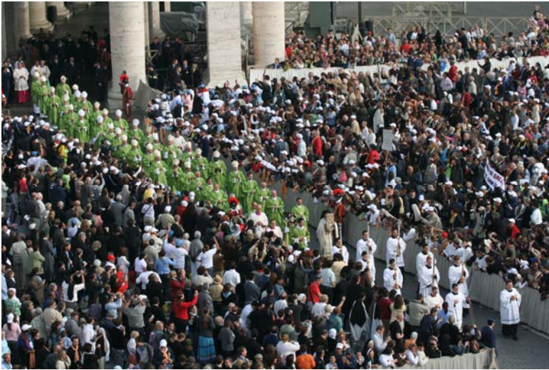
The procession at the canonization of St. Mother Theodore Guerin, SP

Staff carpenters made a new coffin from walnut timber that had been stored on the grounds for more than 40 years. The former coffin was placed inside the new one, then mounted on a base adjacent to the altar in the church. The shrine was first venerated on Saint Mother Theodore's feast day, Oct. 3. Despite many sisters, staff and friends being away for canonization day, the church was filled for liturgy Oct. 15.