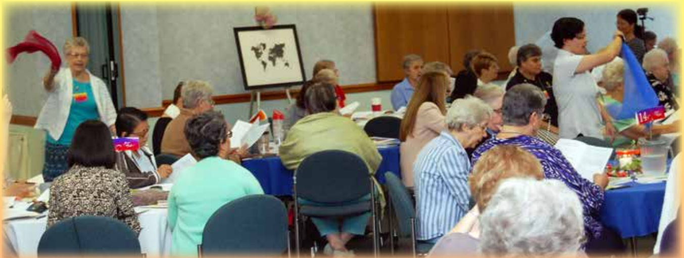
Dancers among the participants during one of the beautiful rituals. Below: Participants engaged in table sharing.