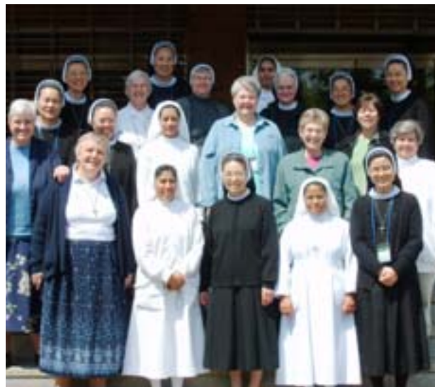
Sisters of Divine Providence gathered for an international formators meeting in Seoul, South Korea.

Next the sisters visited the ministries of the Sisters in Korea. First they visited Chuncheon, where the sisters minister in a rehabilitation center and a nursing home. Next they went to Uijeongbu where the sisters minister in St. Mary Hospital. Finally, they visited a small nursing home called Charity House where three sisters live and work with 14 elderly women. During the memorable experience, the three sisters found a greater understanding of the diversity of cultures in our international congregation and how this diversity enhances our mission of living and ministering to make God's Providence more visible in the world.