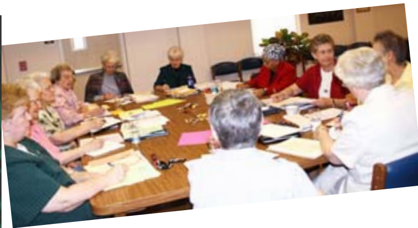
Women of Providence in Collaboration Governing Board members gathered for their March meeting.